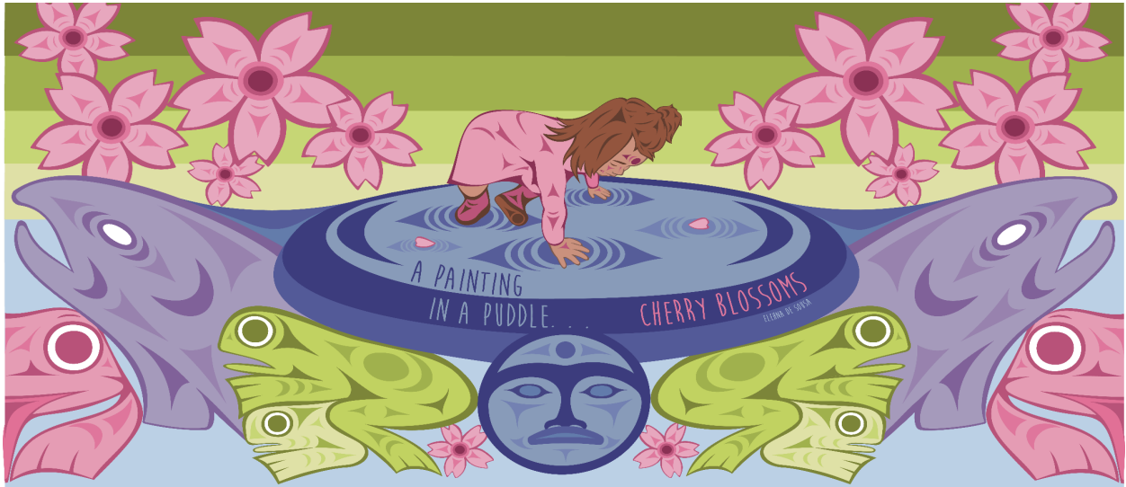
Artwork: Chase Gray | Haiku: elehna de sousa (2022 Haiku Invitational Best British Columbia)