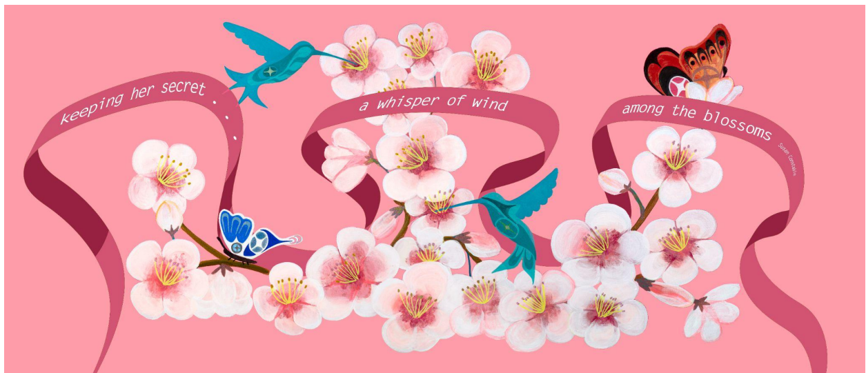
Artwork: Erva Sparrow | Haiku: Susan Constable (2021 Haiku Invitational Best British Columbia)