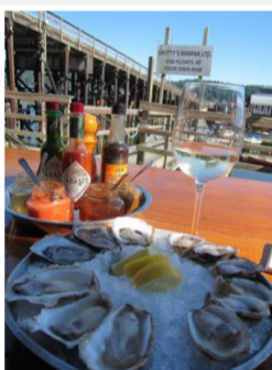
Smitty's Oyster House in Gibsons.

The Vancouver, Coast & Mountains region has world-class restaurants to suit all budgets. And in the spring, with the temperatures finally warming up, many of these restaurants open their patios and invite guests to soak up the sunshine! Some of our favourite patios in the region, for their views or their people watching potential, are Smitty's Oyster House in Gibsons , the Watershed Grill in Squamish , Beatniks Bistro in Fort Langley and The Boathouse in White Rock .