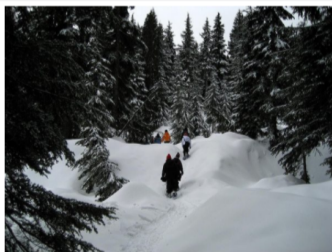
Snowshoeing at Mount Seymour, North Vancouver.

Who says ice cream is just for the summer? Ice cream is making a huge comeback in the region and from old-fashioned ice cream shops to handcrafted artisan ice cream, believe us when we say that this is not your run of the mill ice cream. Feel like a scoop of Malted Milk Chocolate Honeycomb? Or how about Black Sesame? Don't worry, you can still get an amazing scoop of good old vanilla, or strawberry made with the freshest berries! Check out Glenburn Soda Fountain in Burnaby for nostalgic sundaes, milkshakes and egg creams. Or head to the region's newest shop, The Welcome Parlour in North Vancouver for handcrafted scoops of flavours like Cracked Caramel or Lime Coconut.