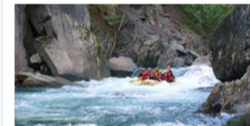
A Weekend Adventure in t... Last summer we spent a glorious exten... BLOG.TRAVEL-BRITISH-COLUMBIA.COM

Read our latest blog on Fraser Canyon and plan your next adventure this summer.