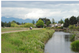
West Dyke Trail in Richmond.

A favourite day trip destination, Bowen Island can be reached by a short ferry ride from Horseshoe Bay. There are a couple of different options for a hike, depending on how energetic you feel. The Killarney Lake trail is an easy stroll that, in two hours, meanders through groves of Cedar and Hemlock, with viewpoints of the lake. Or, challenge yourself with the 6-hour hike up Mount Gardner and back with an obligatory stop for a hot chocolate at Cocoa West . Hikers are rewarded with spectacular views of the North Shore mountains, Howe Sound and the Sunshine Coast .