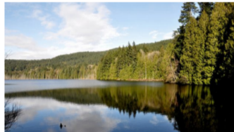
Killarney Lake on Bowen Island.

Every April, Vancouverites celebrate the arrival of spring with the annual Vancouver Cherry Blossom Festival . The actual start date varies, depending on weather, but the festival is a great excuse, if there ever was one, to celebrate those magical pink blossoms that line the streets. Inspired by the age old Sakura festivals of Japan, the Vancouver Cherry Blossom Festival puts on a wide range of events - concerts, haiku contests, a Japanese cultural fair, bike riding, film screenings, and of course, the cherry blossom viewings. Take part in the events or simply look up the map and head out exploring on your own.