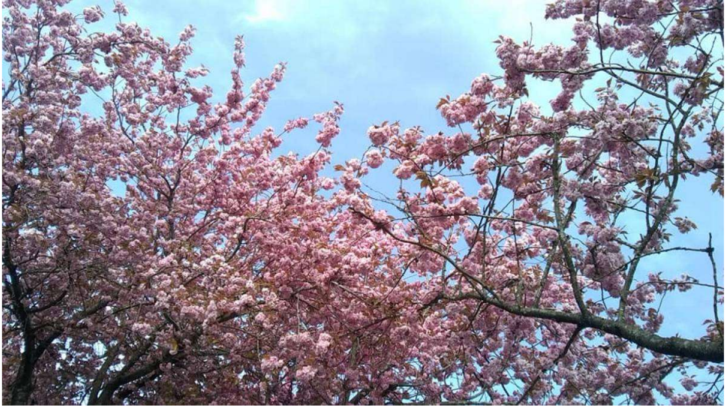
VANCOUVER CHERRY BLOSSOM FESTIVAL

The pink-tinged Sakura Night Gala will be held at 6:30 p.m. on May 5 at the Stanley Park Pavilion (610 Pipeline Road) to raise funds for the Vancouver Cherry Blossom Festival (VCBF), which presents over 23 free events.