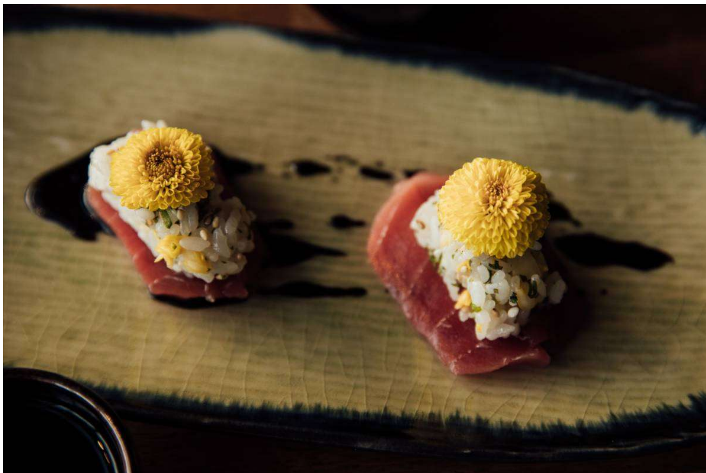
Super Hiro's restaurant owner and chef Hiroki Watanabe's albacore tuna sushi with sesame sauce