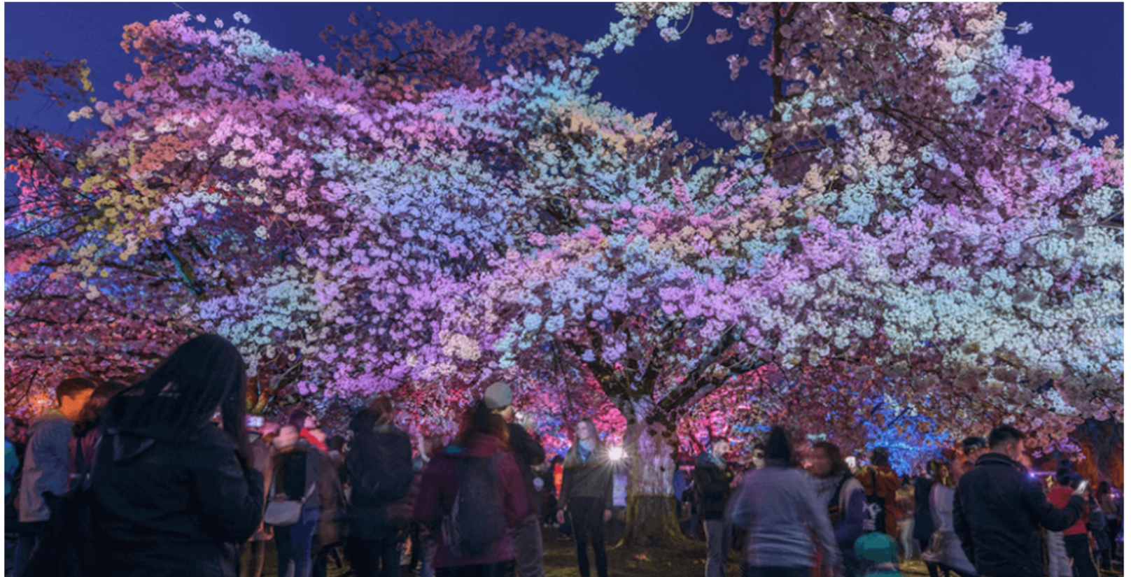
Cherry Blossom light show

After a five-year stint, a popular springtime event in Vancouver that takes place as part of the city's Cherry Blossom Festival has announced it will not be happening this year.