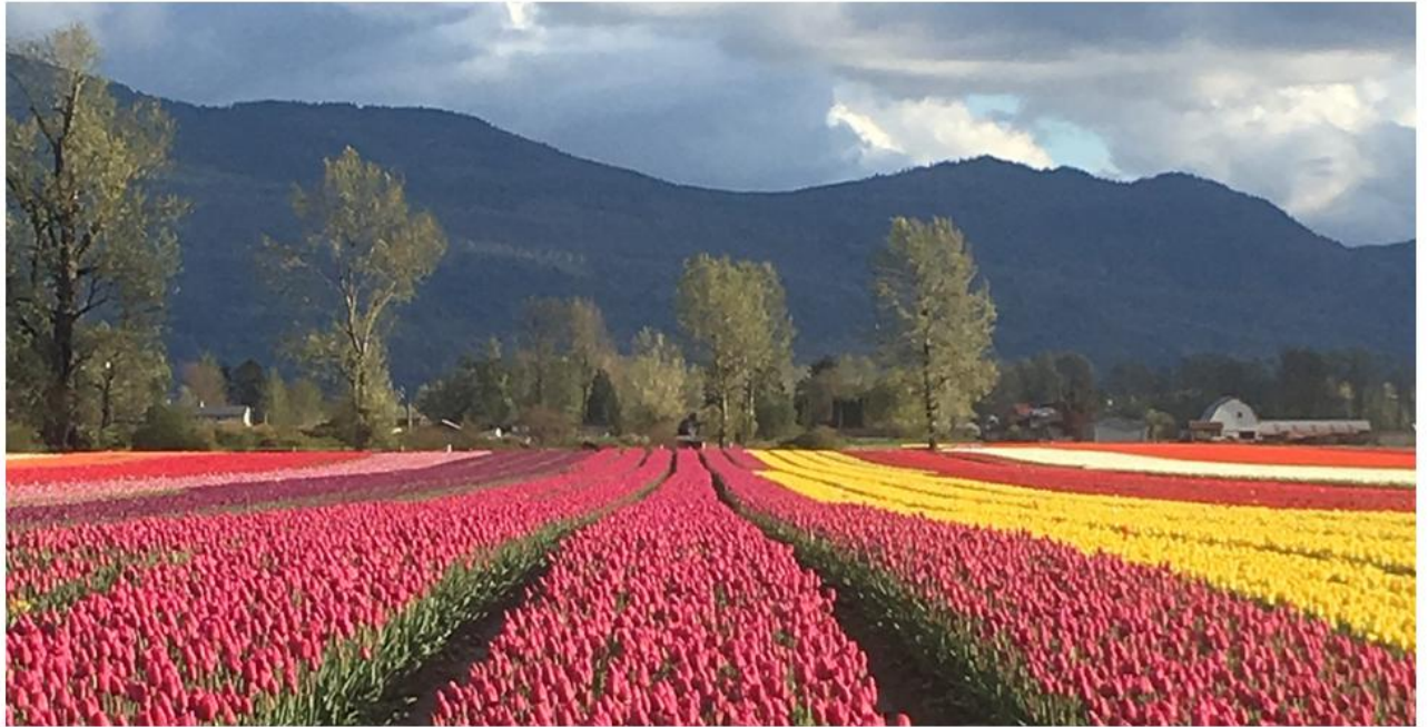
The Chilliwack Tulip Festival

Let's start an amazing April! Here are 70 things to do in Vancouver this month, including Cherry Blossom Festivals, Michael Buble, and more.