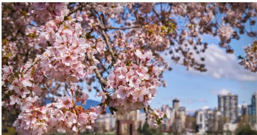
Cherry Blossom Vancouver/Shutterstock

What: Vancouver's annual Cherry Blossom Festival is a celebration of the city's gorgeous pink cherry trees and a welcome sight for the winter-weary Vancouverites. The Cherry Blossom Festival looks to show off close to 40,000 trees, many of which originated as gifts from Japan. The festival looks to express the city's gratitude while celebrating the beauty and joy that the blooms with the flowers. New to this year, festival organizers have made the point of asking anyone taking photos in neighbourhoods to be respectful when visiting.