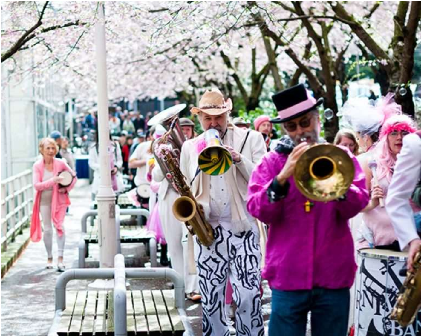
Cherry Jam Downtown Concert.

Don't miss other Festival Signature Events which include: